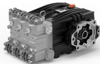
VXX-B 75/350 R MI