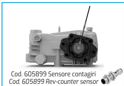
Cod. 605899 Sensore contagiri Cod. 605899 Rev-counter sensor