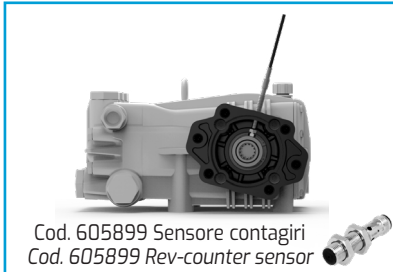
Cod. 605899 Sensore contagiri Cod. 605899 Rev-counter sensor